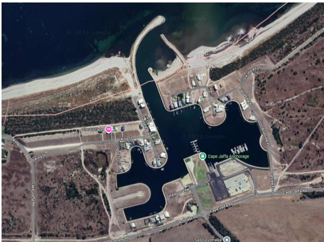
Figure 1 – Cape Jaffa Anchorage Marina

Currently there are 114 allotments constructed within the development, of which 50 are built on. Twenty of these are permanently occupied with the remaining used as holiday homes or rentals. A map of the scheme is included at Appendix B .