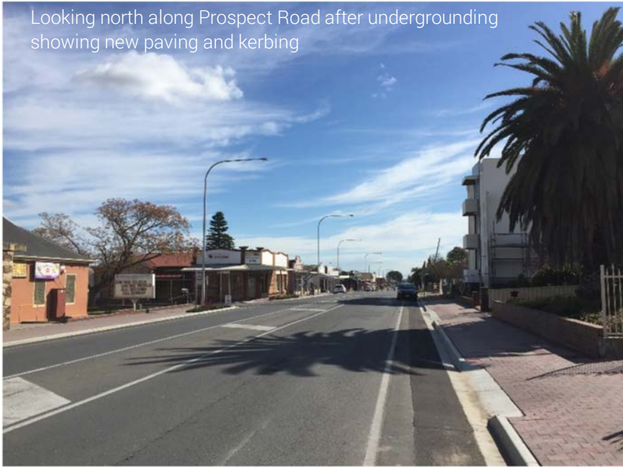
Looking north along Prospect Road after undergrounding showing new paving and kerbing