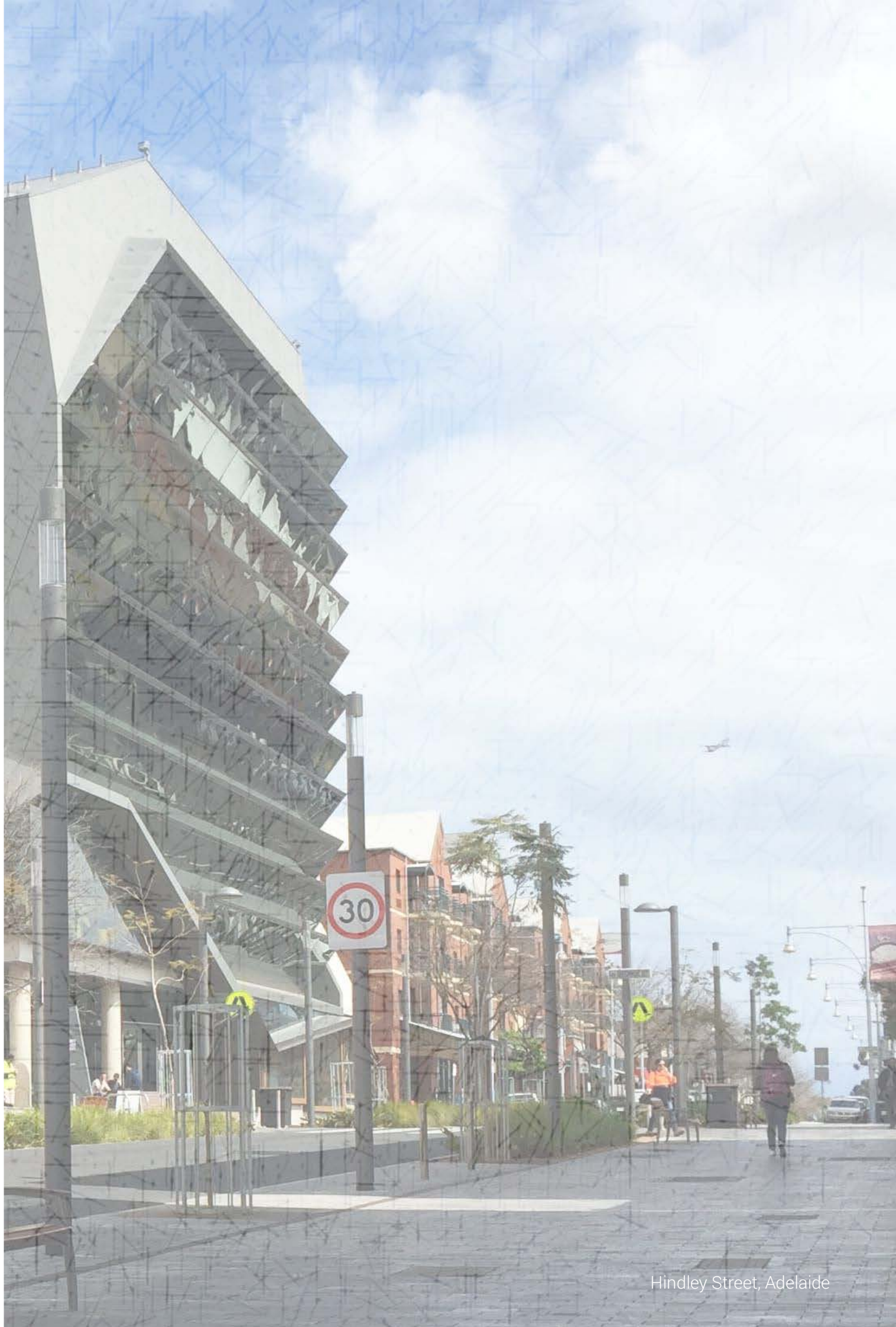
Hindley Street, Adelaide