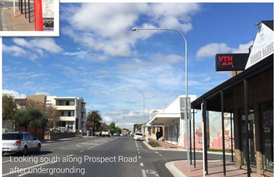
Looking south along Prospect Road after undergrounding.