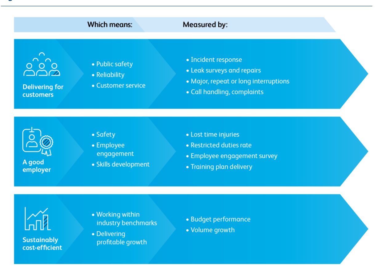
Figure 4: Australian Gas Networks Limited Vision Statement

AGN communicates its Vision to all key stakeholders, such as employees/contractors, governments, regulators, investors and our customers. Importantly, all of the objectives set out in the Vision can be measured, including in most instances against the performance of our industry peers. AGN publicly reports on our performance under our Vision, most recently