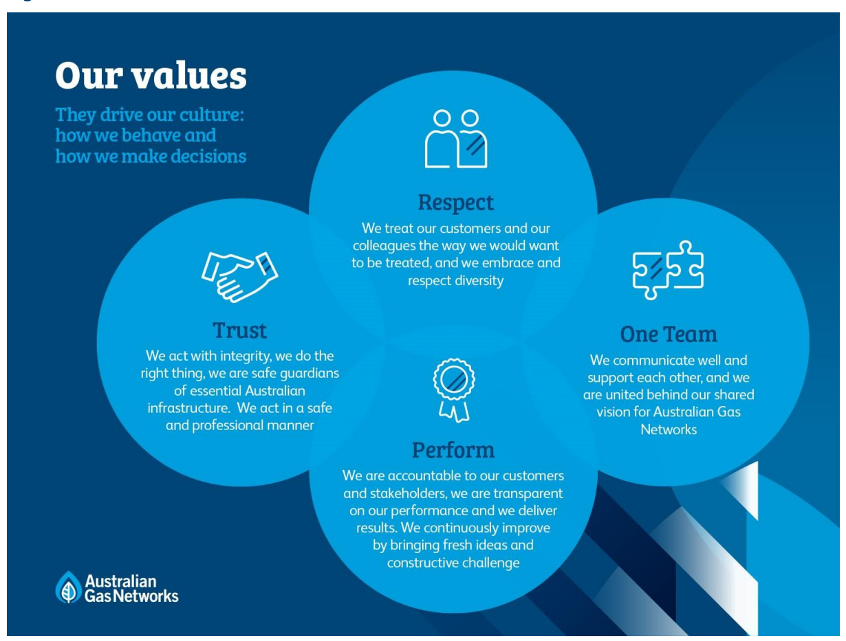
Figure 5: Australian Gas Networks Limited Values

These values underpin a culture of honesty and integrity for the business and its officers and shareholders. These values are also reflected in our policies and procedures, which are described in more detail in Attachment 4 – Key Policies and Procedures and which are available on the AGN website: <a href="https://www.australiangasnetworks.com.au/our-business/about-us/work-with-us/code-of-conduct-and-ethics">https://www.australiangasnetworks.com.au/our-business/about-us/work-with-us/code-of-conduct-and-ethics</a>.